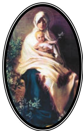
CCW Cabrini Parrish

The Council of Catholic Women of St. Frances Cabrini would like to thank everyone who gave to the Angel Tree this year. Through your generosity, 360 children were blessed to receive Christmas gifts this year. The CCW also collected $5,470 worth of gift cards which will help provide for the needs of the families this year.