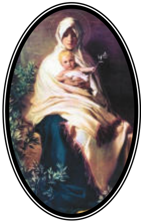
CCW Cabrini Parrish

The next CCW meeting is January 19, 2020 at 11:30am Rosary, 12:00pm Mtg. and Luncheon. All women of the parish are invited to attend.