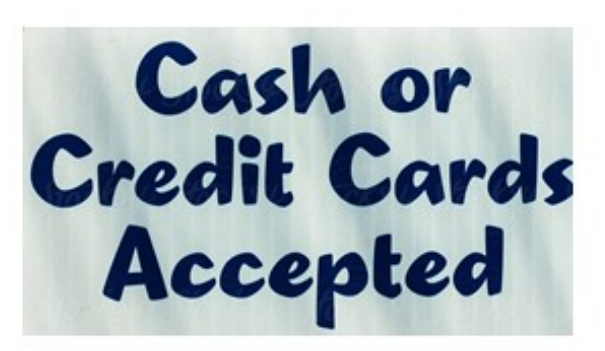
12001 69th Street East Parrish, FL 34219

Fish, Fries, and Slaw Shrimp, Fries, and Slaw Combo Platter $13 each or $25 for Two